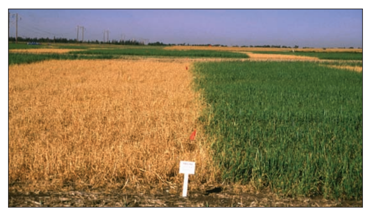
Glyphosate drift with 20 km/h side wind, TD11004 60 psi

governments, universities, and the private sector), participated in studies throughout Europe, Australasia, and North America looking at low-drift spray performance. In Canada alone, we conducted over 100 studies and concluded that pesticide efficacy was not harmed when a properly adjusted low-drift nozzle was used. A surprising result showed that fungicides did not seem to need finer sprays, contrary to popular opinion, as long as water volumes were sufficient to provide adequate coverage.