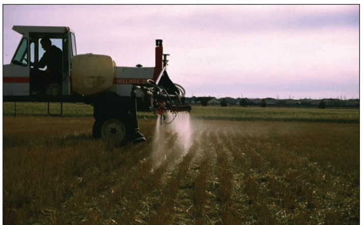
Low-drift nozzles (TD11004) operating at 60 psi

In the late 1990s, the crop protection industry (including