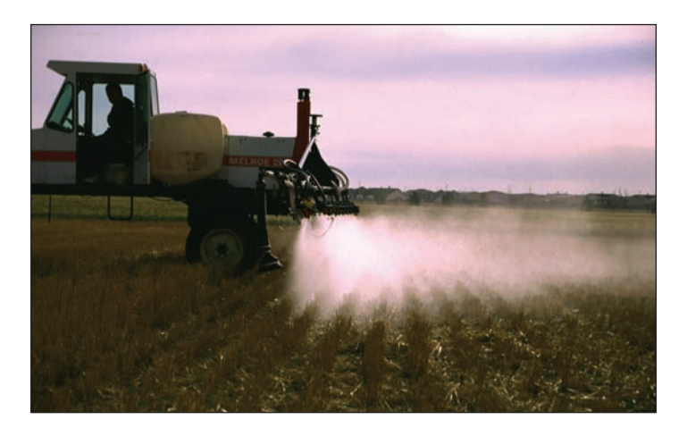
Conventional flat fan nozzles (XR8004) operating at 40 psi

When these tips first hit the mainstream as "pre-orifice" nozzles in the late 1980s, and later as "venturi" nozzles in the mid 1990s, we were impressed with their ability to reduce drift. And the obvious question was, what about product efficacy? Can fewer, larger droplets do the job? The answer, to our initial surprise, was yes.