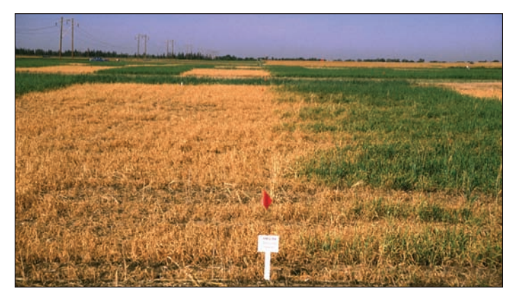
Glyphosate drift with 20 km/h side wind, XR8004 40 psi