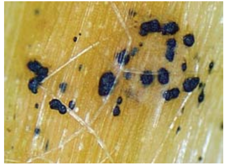
Figure 2. Black dot mircosclerotia on the surface of a potato root, and root hair.