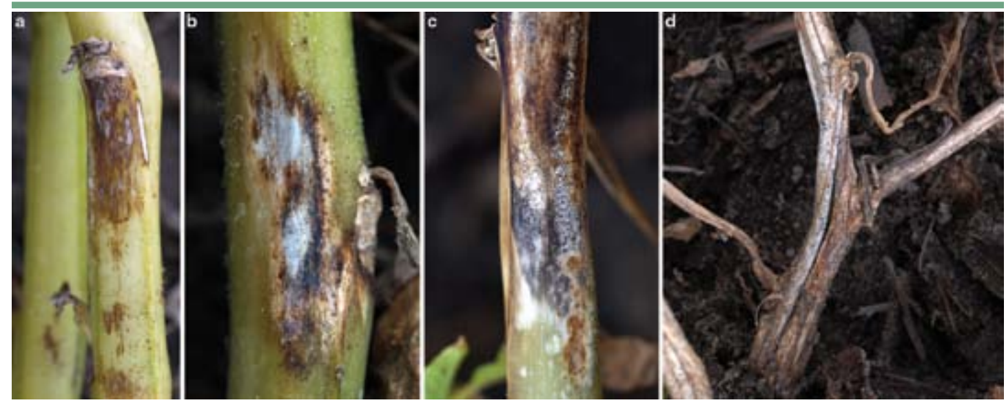
Figure 3. Black dot stem lesions start out as pigmented flecks (a). Lesions may coalesce developing irregularly shaped, white to straw-colored centers (b) and eventually girdle the stem (c). Microsclerotia form in lesion centers (c). Late in the season after or after vine kill, microsclerotia may cover the base of the plant near the soil sufrace (d).

level late in the season and after vine kill (Fig. 3d).