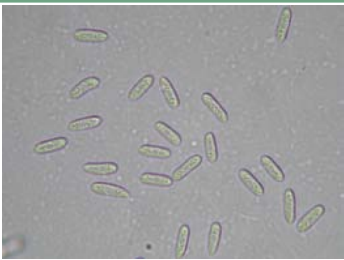
Figure 5. Spores of the black dot pathogen Colletotrichum coccodes.

approach. The disease is controlled primarily through the use of cultural practices and fungicides. Cultural control